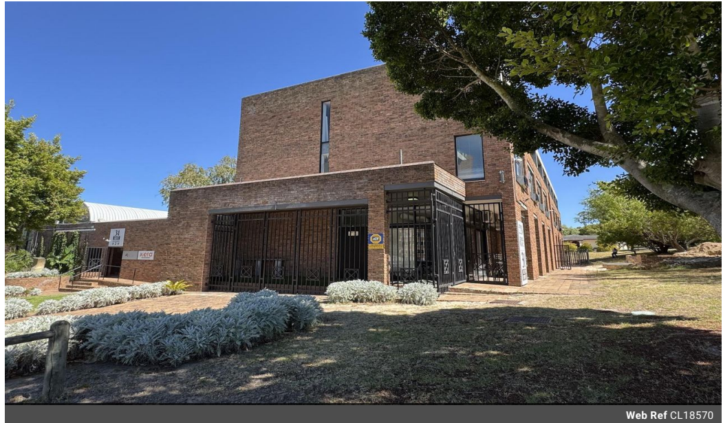
Web Ref CL18570