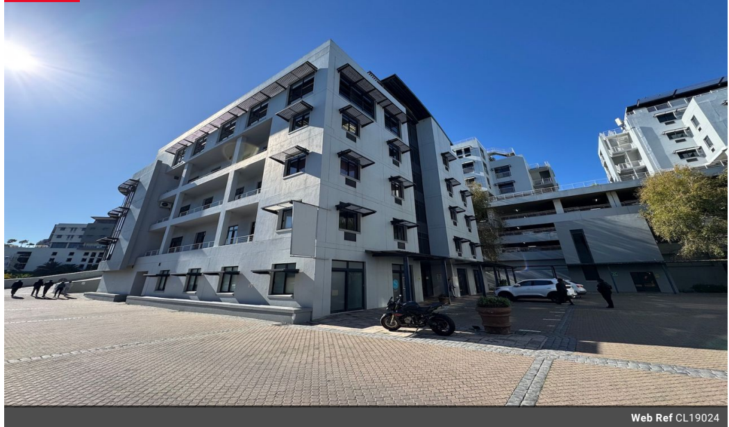
Web Ref CL19024