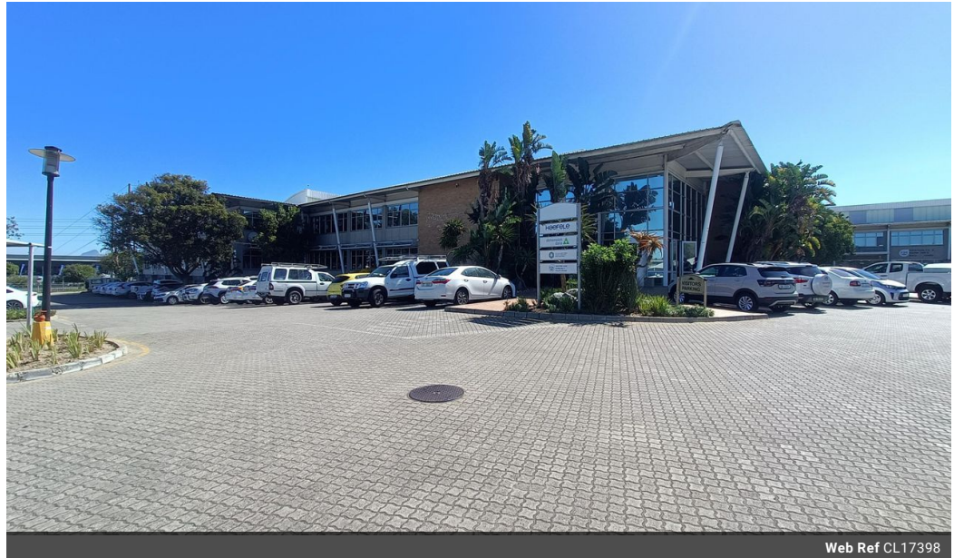
Web Ref CL17398