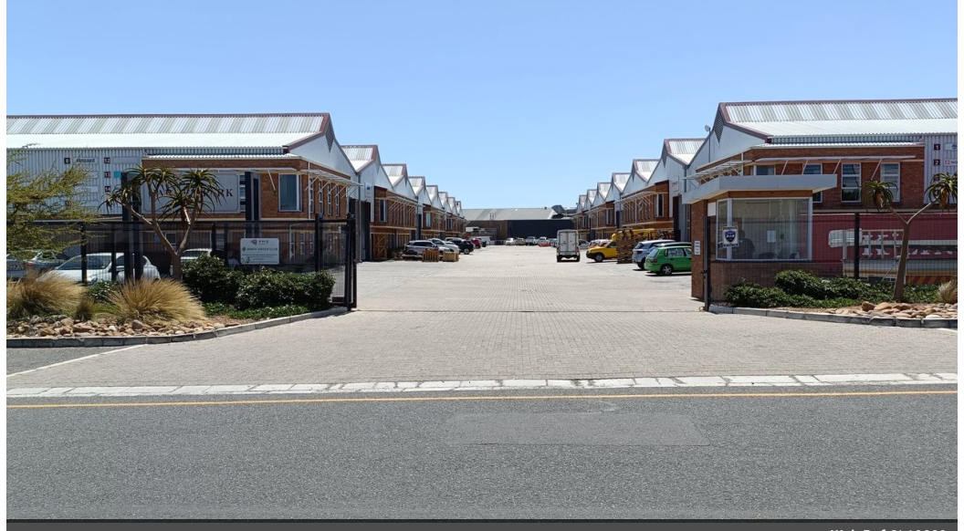
Web Ref CL19039